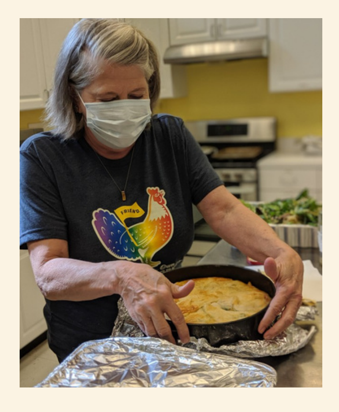
Feeding Our Community

pounds of locally grown, fresh fruits, vegetables, proteins & bread provided FREE to local families experiencing food insecurity